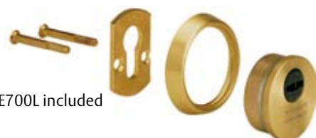
Escutcheon E700L included